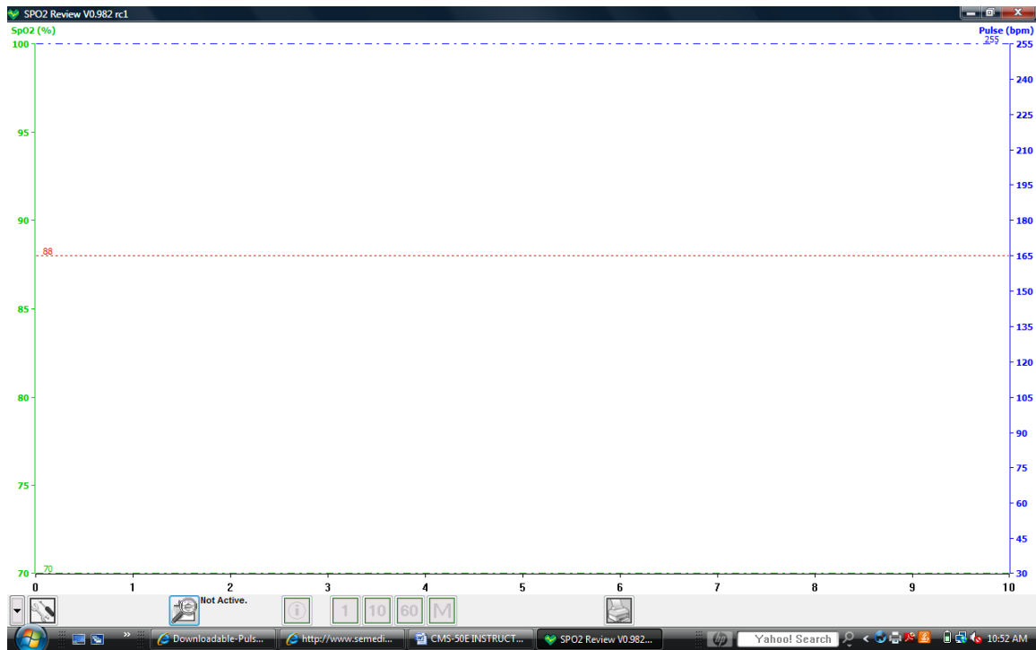
(Screenshot of SPO2 Review Screen when first opened).