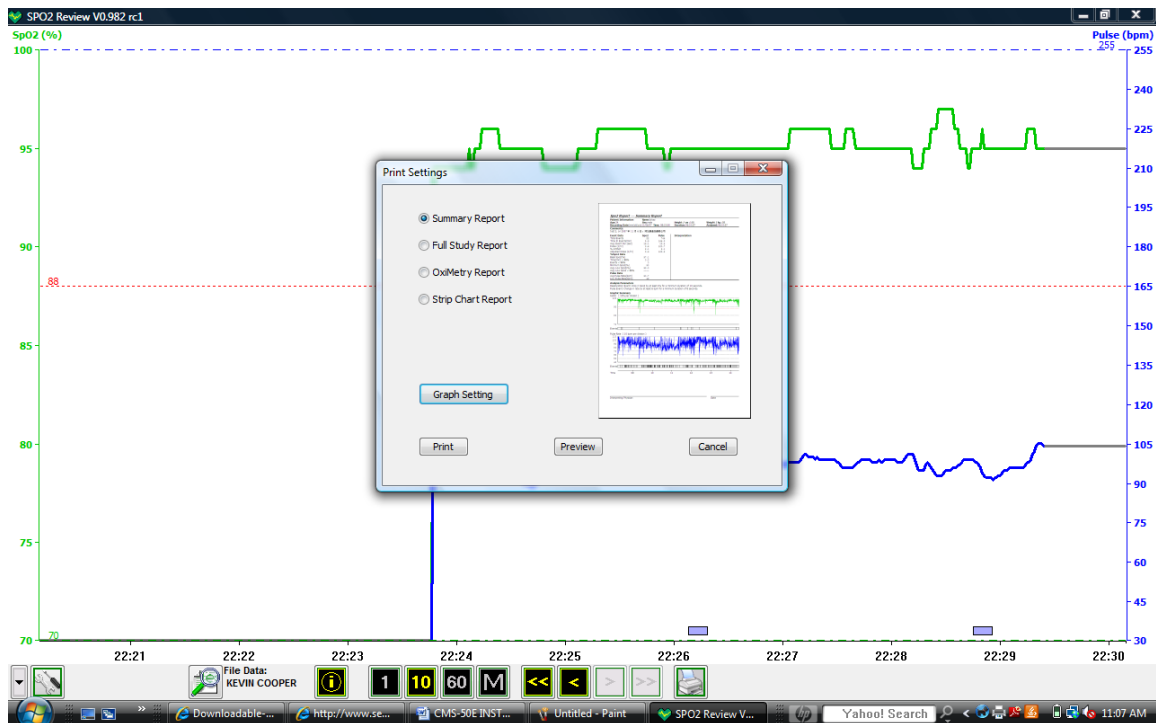
(Screenshot after hitting printer button. You will have the option of which report you want to print from Summary Report, Full Study Report, Oximetry Report, or Strip Chart Report).