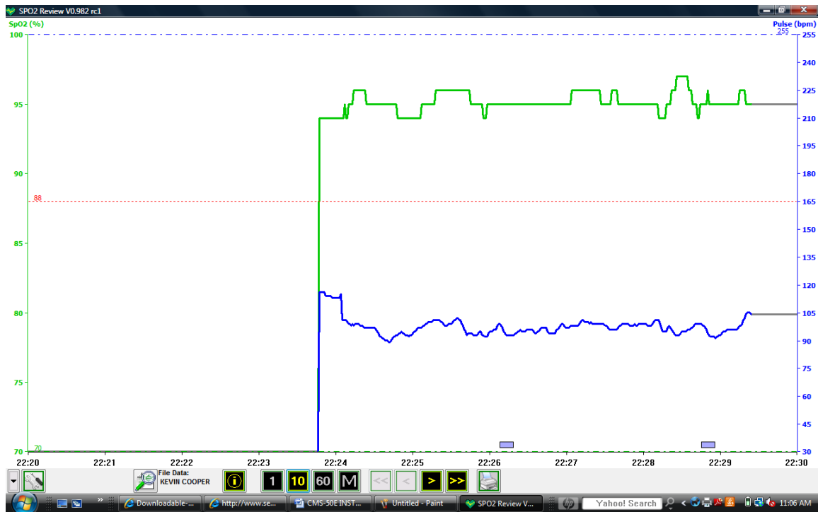
(Screenshot of sample data recording in SPO2 Review)