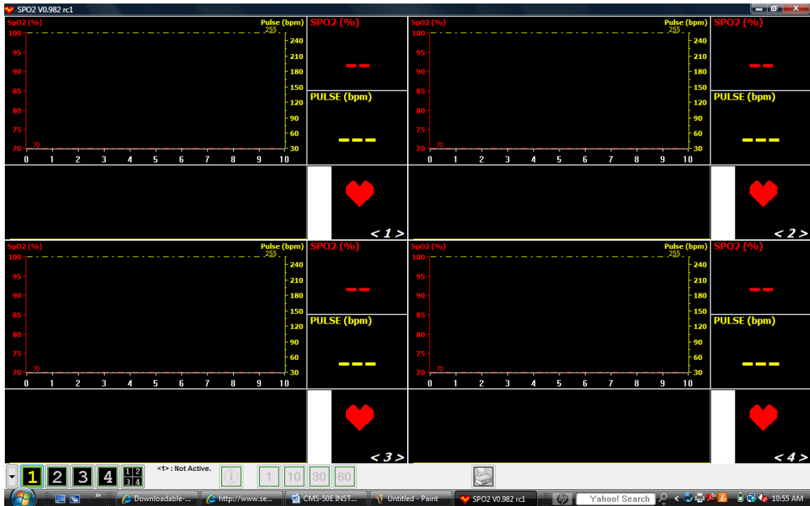
(Screenshot of SPO2 with 4 oximeters on screen)